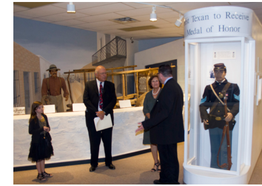
Texas Heritage Museum Open House